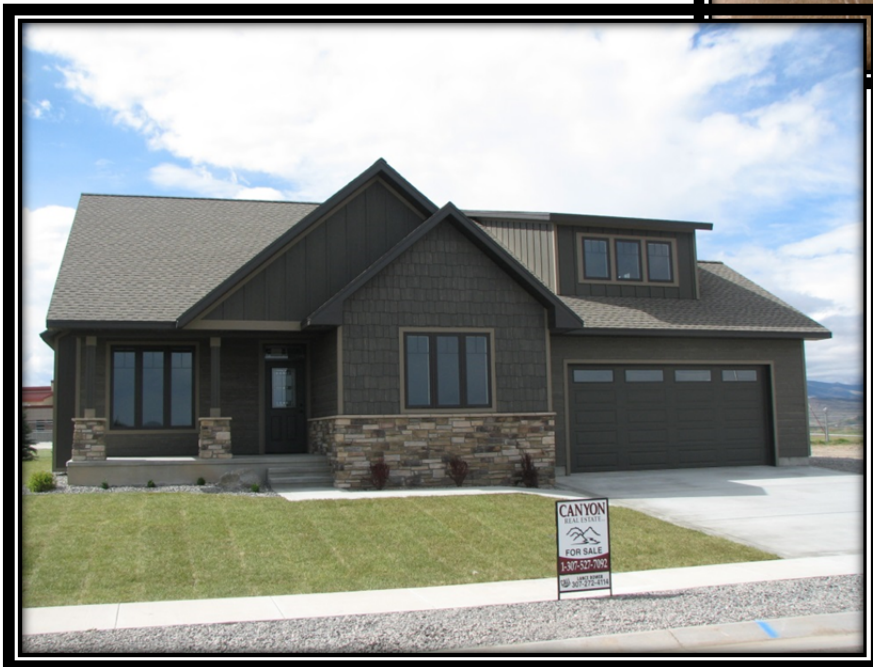
Beautiful Hand Crafted Home