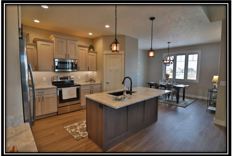
Kitchen & Dining