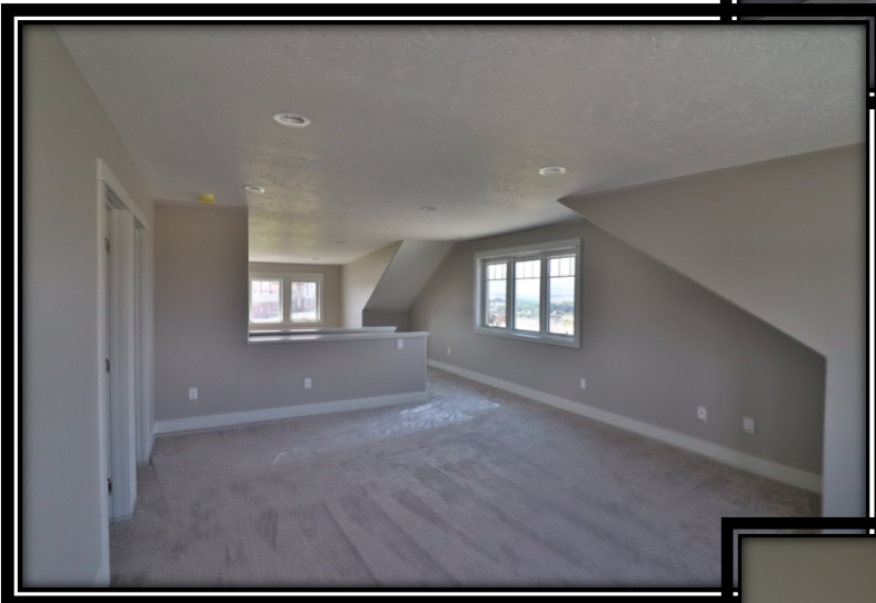
Includes a ¾ Bath